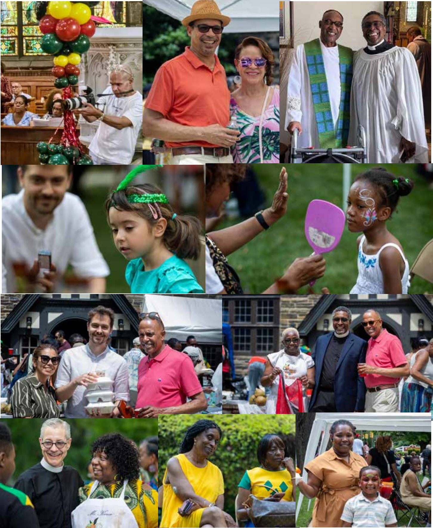
More photos may be found on Facebook