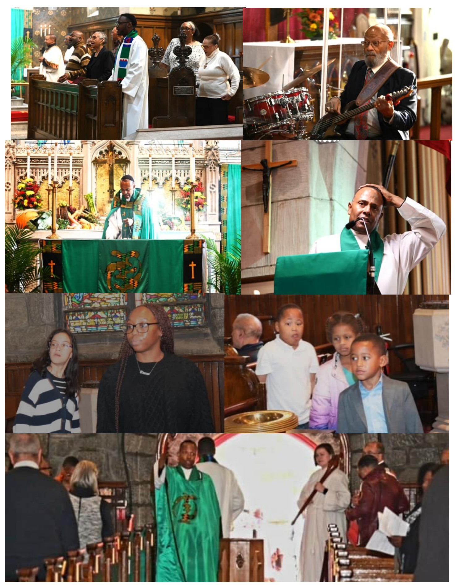
More pictures may be found on our Facebook page.