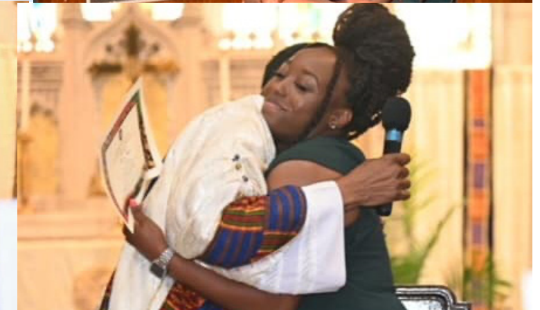
More pictures may be found on our Facebook page .