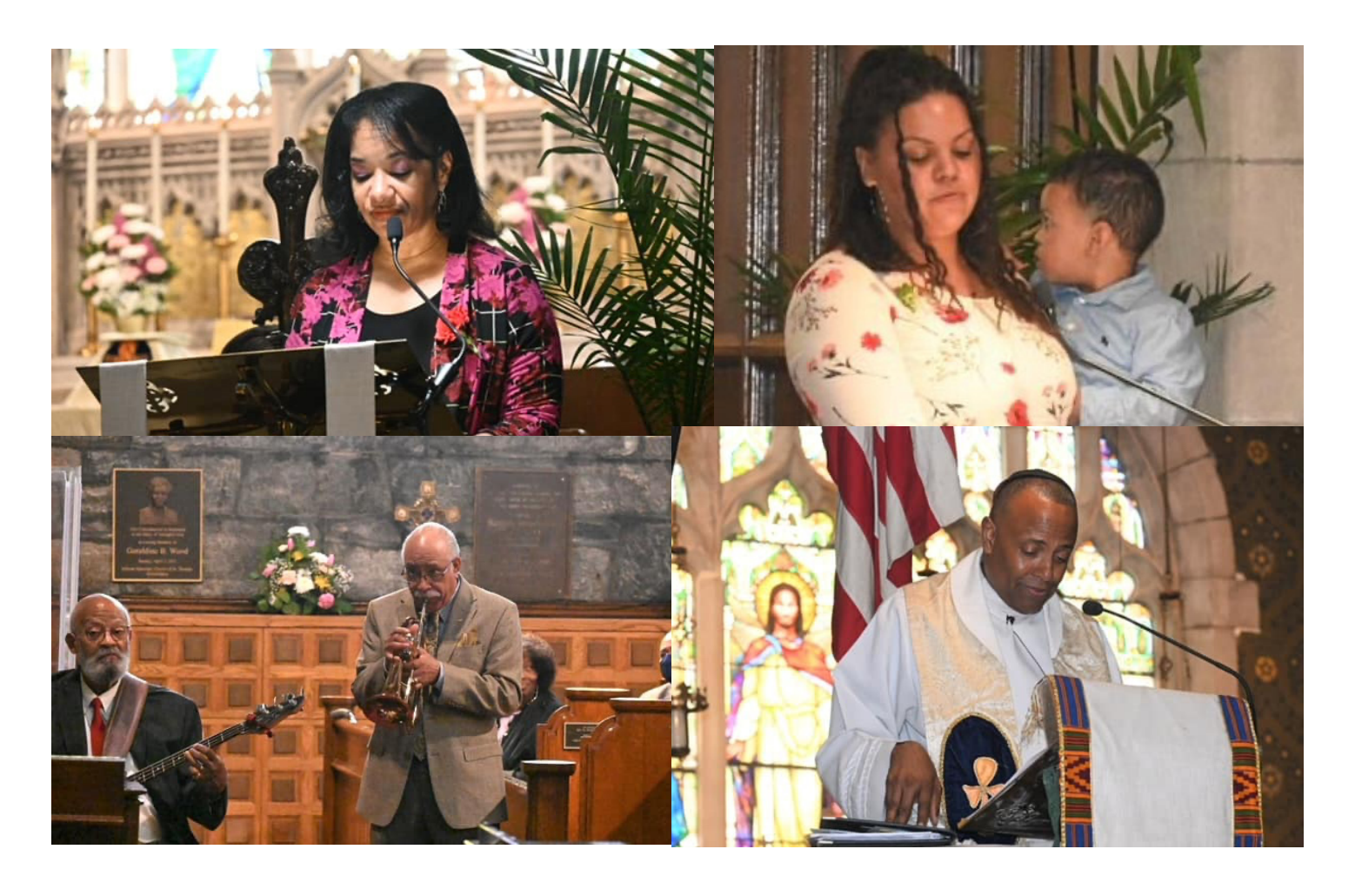
We celebrated Mothers/Mother Figures last Sunday.