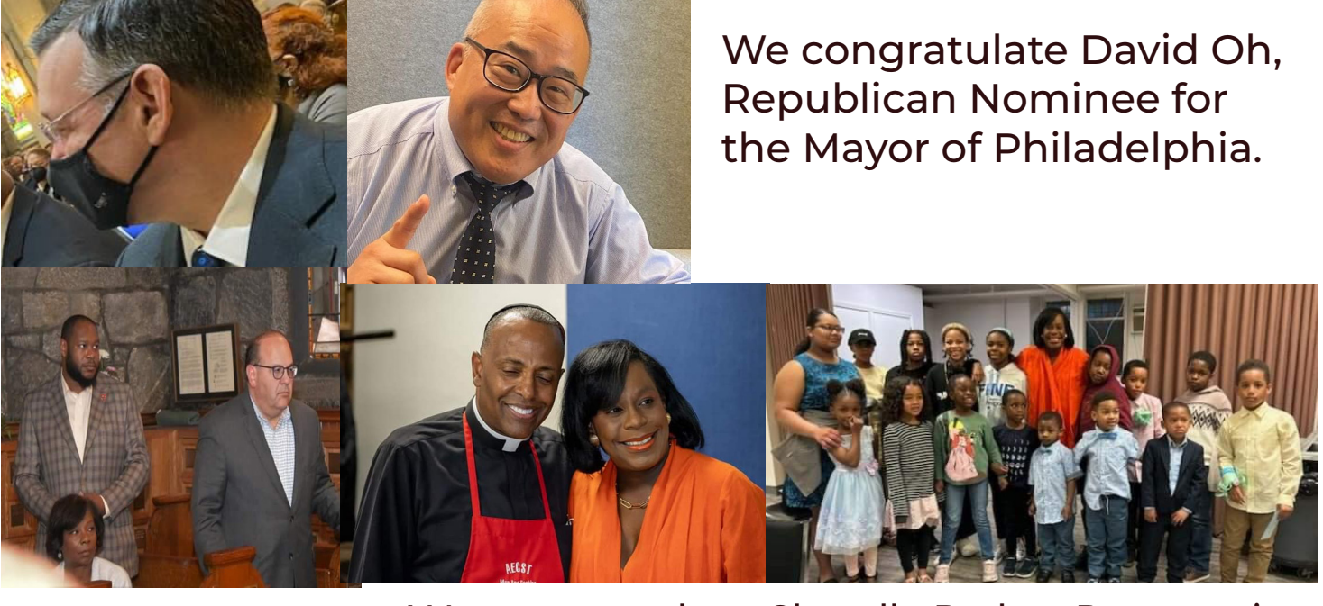
We congratulate Cherelle Parker, Democratic Nominee for Mayor of Philadelphia