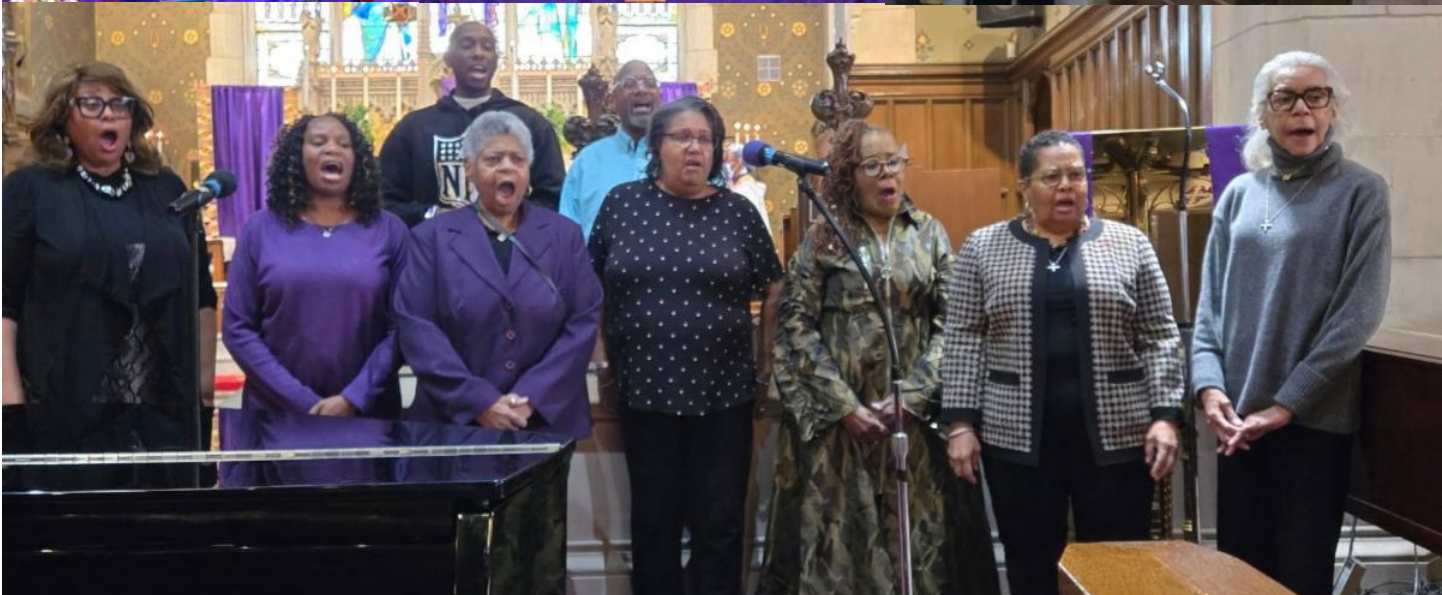
More pictures may be found on our Facebook page.