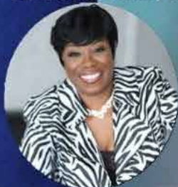
Carmella Green Soprano