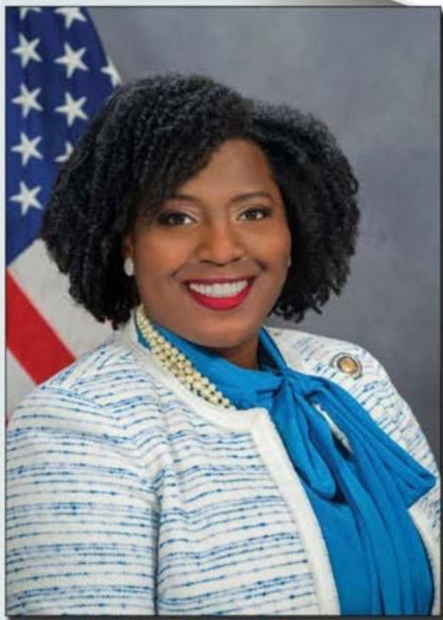
GUEST SPEAKER: THE HONORABLE JOANNA MCCLINTON FIRST WOMAN ELECTED PA SPEAKER OF THE HOUSE