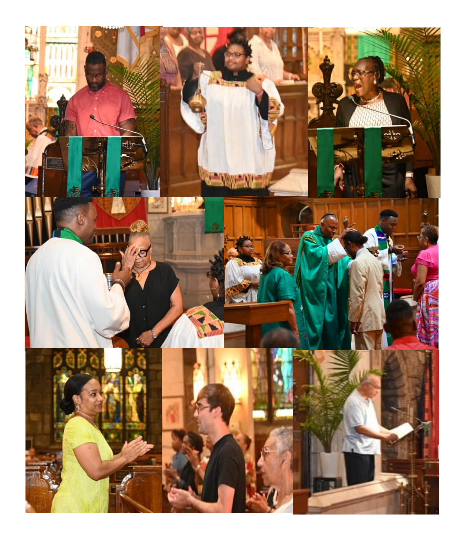
More pictures may be found on our <u>Facebook page</u>.