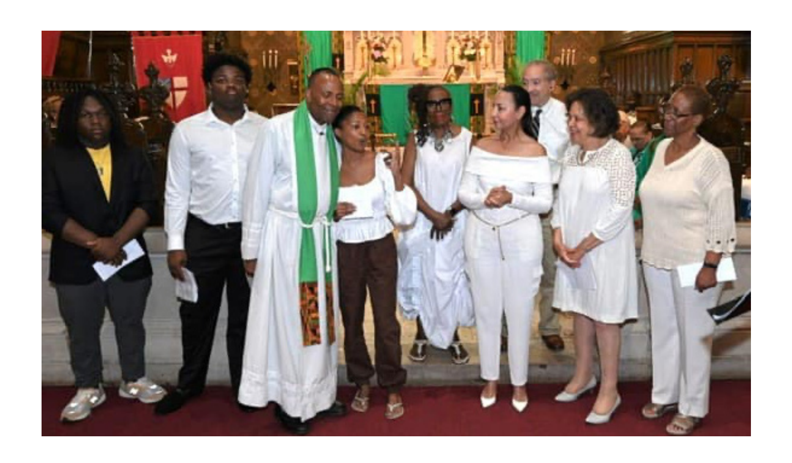
More pictures may be found on our Facebook page.