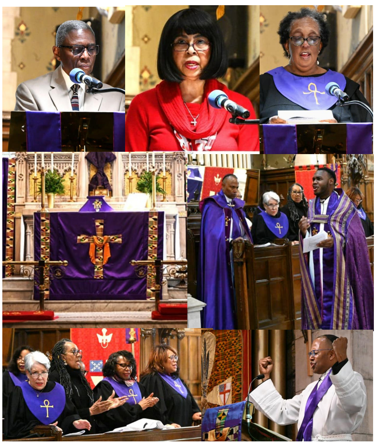
More pictures may be found on our <u>Facebook</u> page.