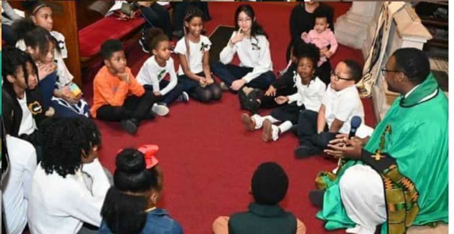
More pictures may be found on our Facebook page.