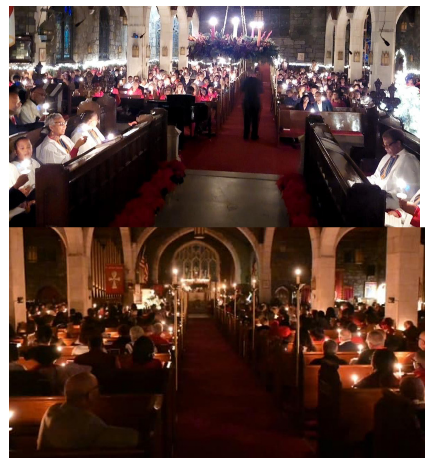
More pictures may be found on our <u>Facebook</u> page.