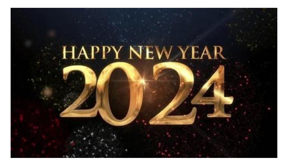
START THE NEW YEAR RIGHT!

Join us next Sunday, January 7th (the First Sunday after Epiphany) as we give thanks, receive the sacrament, and offer a "liturgical toast" to the new year.