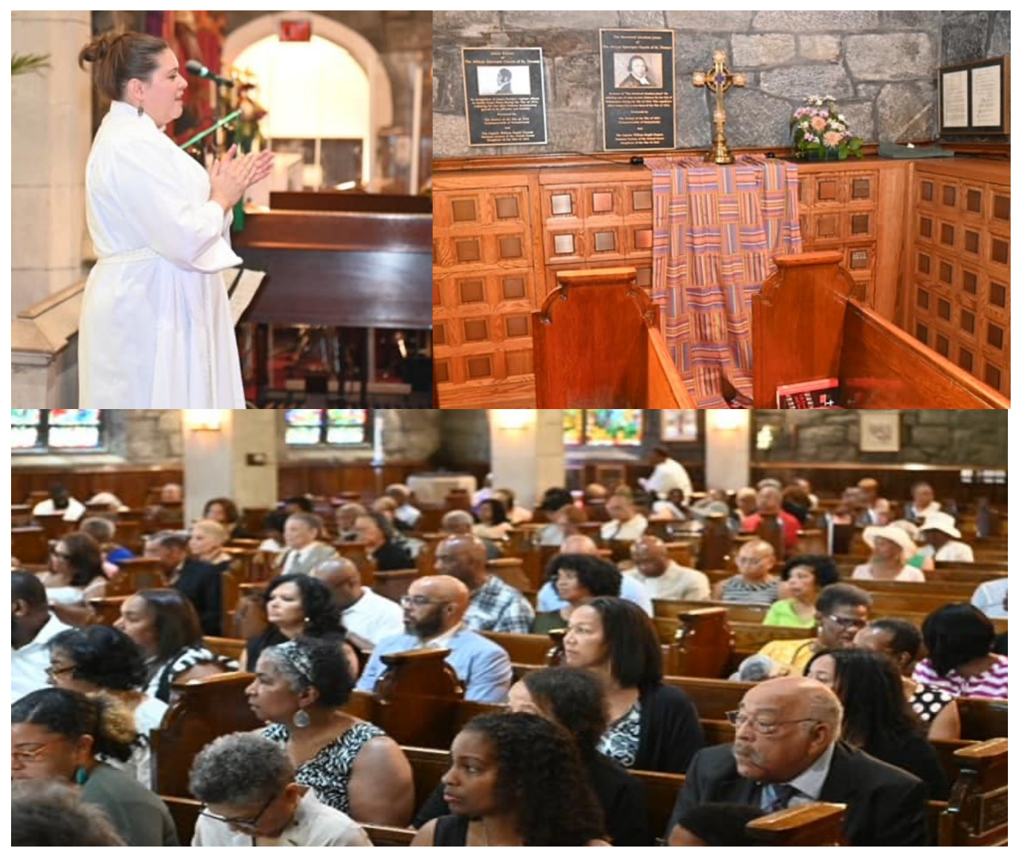
More pictures may be found on our Facebook page.